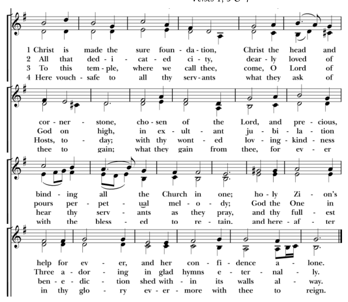
THE CLOSING HYMN Hymnal 1982 #518 Christ is made the sure foundation Westminster Abbey Verses 1, 3 & 4