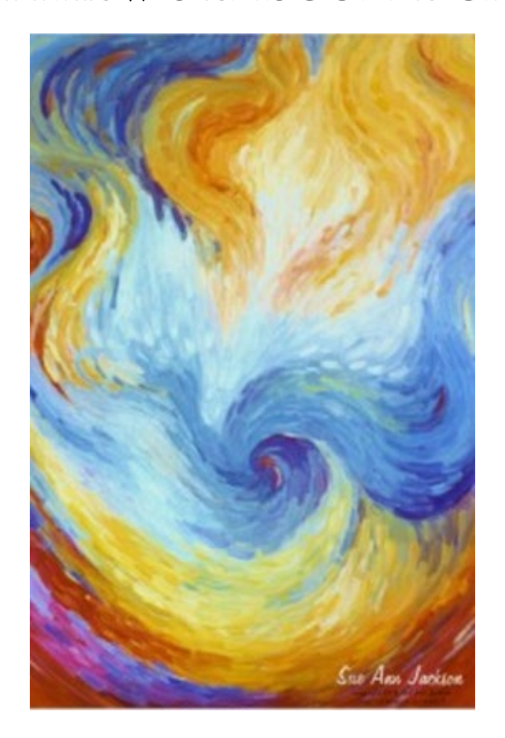
Sixth Sunday of Easter MAY 25, 2025 10:30AM IN THE CHURCH